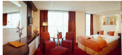
Amadeus Suite Diamond 1