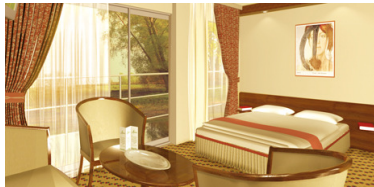
Amadeus Suite Elegant